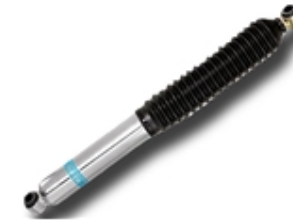
Carli Bilstein 5100 Shock Package 94-12 Dodge Cummins