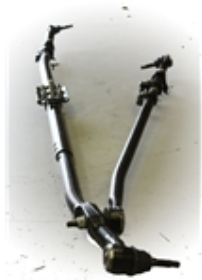
Mopar 09 Steering Upgrade Kit for 03-08 2500/3500