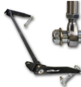
Carli Torsion Sway Bar 03-12 1500/2500/3500 Dodge Ram