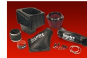
Banks Ram Air Intake System 2003-2007 5.9L Dodge Ram Cummins