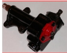
Red-Head Steering Gear Box 03-08 5.9L / 6.7L Dodge Cummins 2879